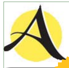
RH Banner Logo Banner Ad (105 x 105 pixels)

for Splash Page and Banner Ads and Newsletter Logo inclusion: