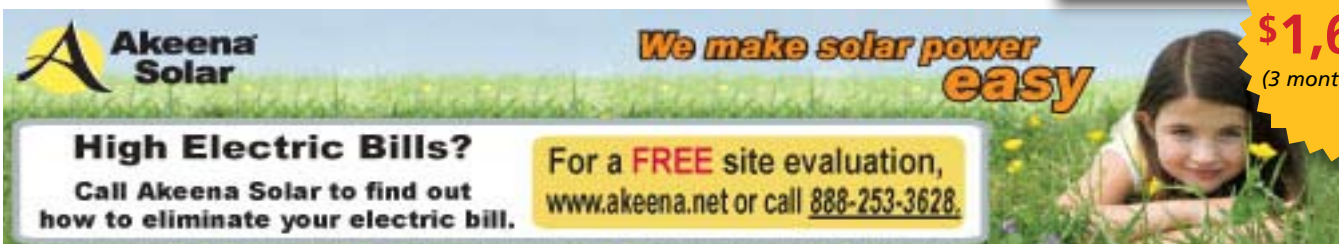
Masthead or Footer Banner Ad (504 x 90 pixels)